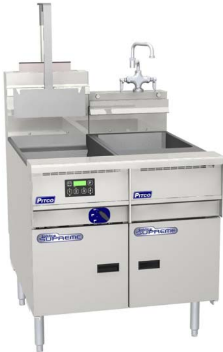
Model SSPG14/SSRS14 Shown with option: Single Basket Lift