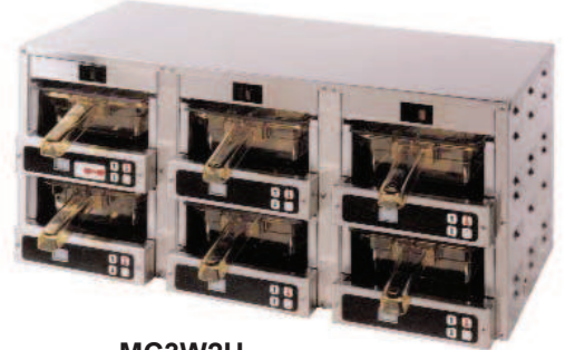
MC3W2H (shown with optional pans)