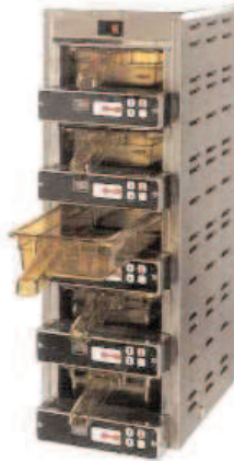
MC1W5H (shown with optional pans)