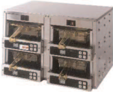
MC2W2H (shown with optional pans)

Since 1947, Foodservice Equipment That Delivers!